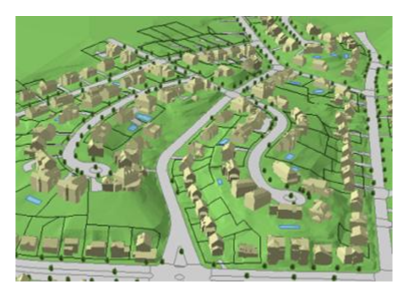
Figure 6: 3D Scenes with draped 2D features which take on the z-coordinates of the DTM

From the illustrations as demonstrated in Figs. 5 and 6, it is feasible, with relevant selection of the layers or 3D objects, to produce 2D topographical plan by printing the plan view of the 3D scene. This negative effect of this approach is the duplicated 2D symbols of some of the 3D objects.