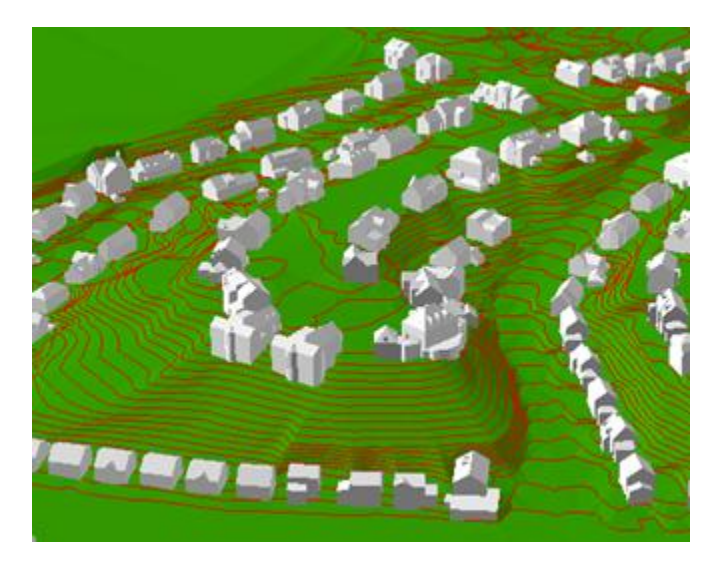
Figure 5: DTM with Contours and Building

On the assumption that 2D topographic plan are still required to be produced according to stipulated drawing standard, such as CP83, there is a need to incorporate 2D symbols into the 3D model in separate layers or treat as separate objects. These 2D symbols could be drapped to the DTM of the model. Figure 5 showed a DTM with contour lines and 3D buildings. 2D Cadastral boundary could also be drapped over the DTM (Fig. 6).