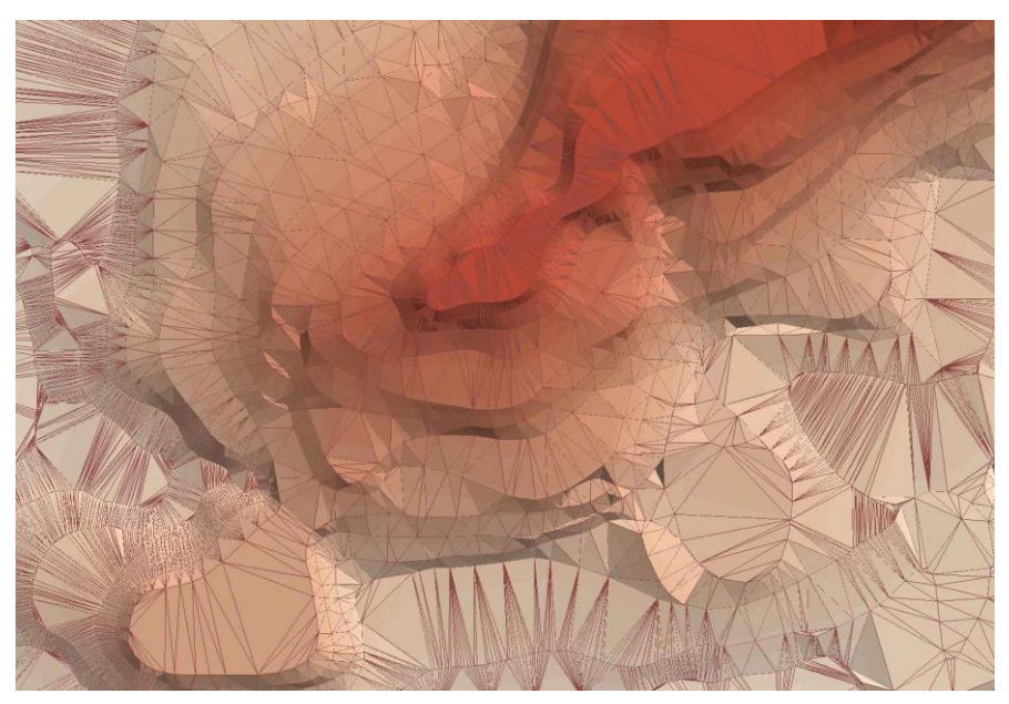
Figure 4: Terrain in the form of TIN

A Digital Terrain Model (DTM) is a digital model or 3D representation of a continuous surface of terrain and it represents the bare ground surface without any objects like plants and buildings. Continuous surfaces can be discretized into sets of single basic units, such as square, triangular, or hexagonal cells, or into irregular triangles (which known as Triangulated Irregular Network,TIN) or polygons which are tessellated to form geographical representations. The use of irregular triangles, long used in land surveying, is based on the principle of triangulation whereby the continuous surface of the land is approximated by a mesh of triangles whose apices or nodes are given by measured 'spot heights' at carefully located trigonometric points. Figure 4 showed the sample of vector terrain in the form of TIN. To optimize and better illustration of terrain surface, TIN are normally converted into raster grid terrain which commonly shared across any functional organizations.