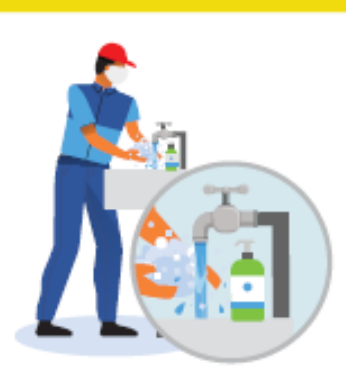
Hand soap is readily available at all hand washing sinks.